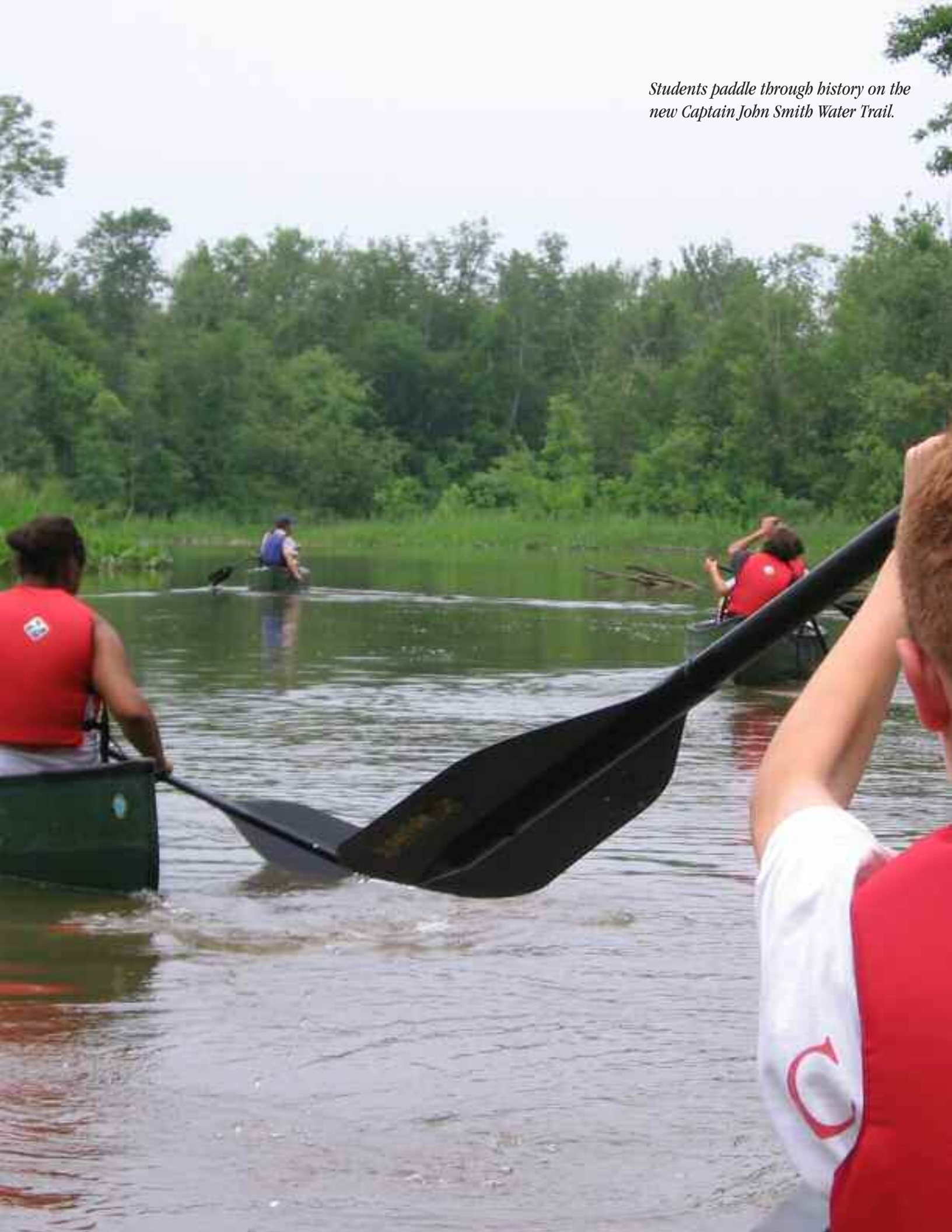
Students paddle through history on the new Captain John Smith Water Trail.